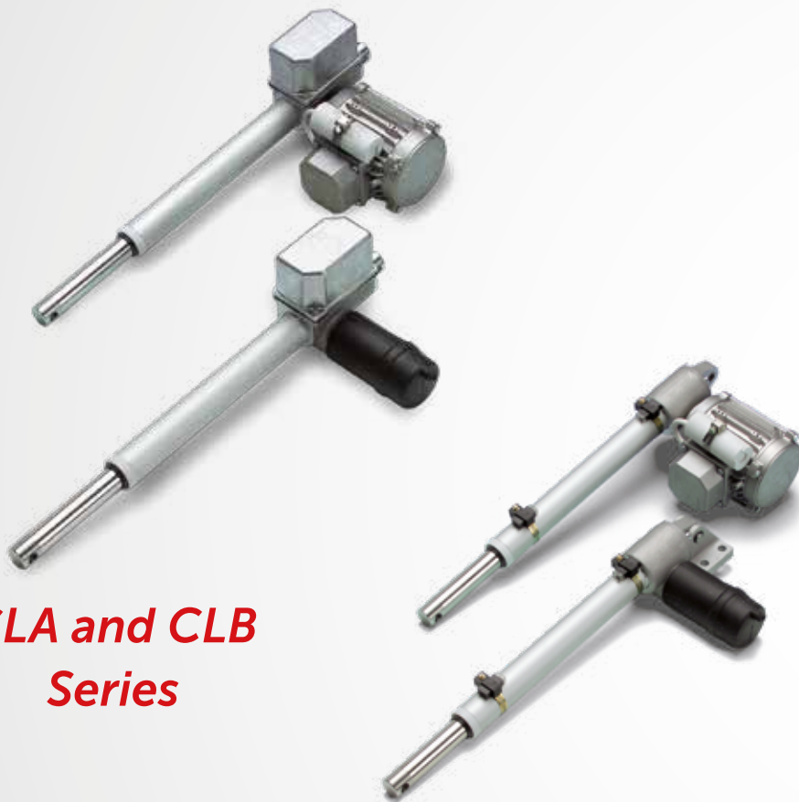
CLA and CLB Series